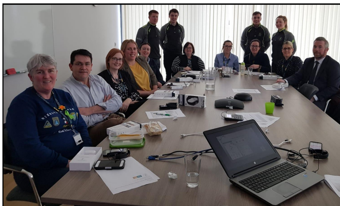
Participants from Meath County Council getting set up with their Fitbits

The programme is aimed at people who presented with low levels of activity. The target for all participants at the end of the 12 week programme is that all will be achieving 10,000 steps on a daily basis.