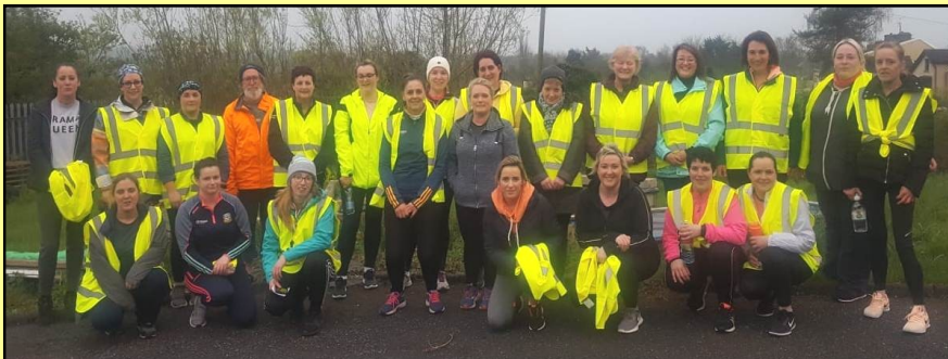
Participants from 0 to 3k Kells

We are delighted to launch two 0 to 3k Programmes taking place in Meath starting in April in Kells and Bettystown .