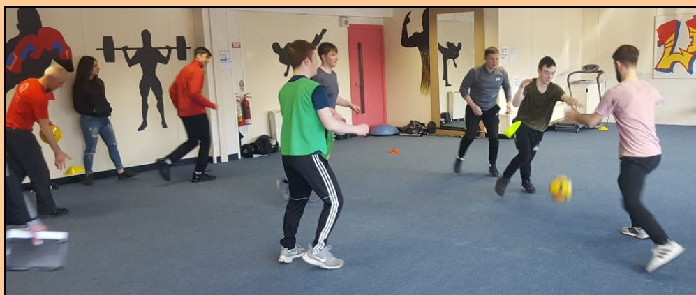
Laytown Youthreach in action!