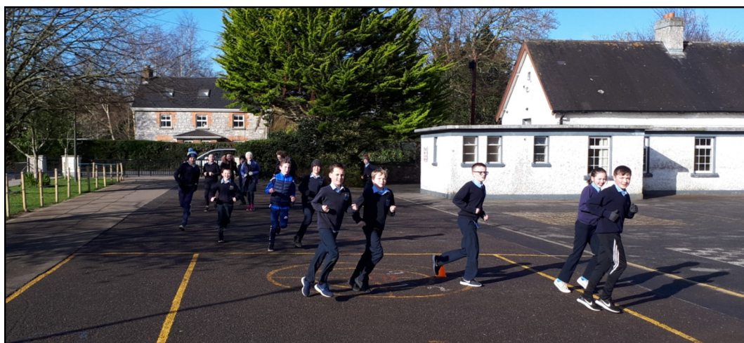
Pupils from Cannistown NS

If you are interested in starting The Daily Mile with your whole school or one of the classes in your school, please contact Lisa at lo-dowd@meathcoco.ie