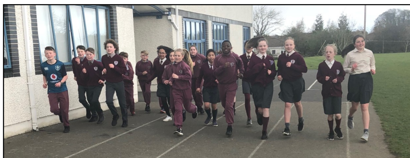
Pupils from Ratoath Senior NS

Meath currently has the highest number of participating schools nationwide with 51% of schools taking part in the County!