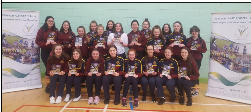
Students at Loreto Secondary School, Navan

Each week there is a compulsory session that is outlined in the iRunForFun diary. Each session will take no longer than 10-15 minutes to complete and should take place during physical education (PE) class each week for a period of 6 weeks. The training should take place around a fixed loop of approximately 150-250 meters. A basketball court, large hall, or half a GAA/ Soccer pitch is perfect for this.