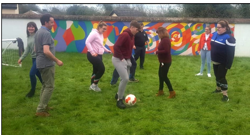
Participants from Involve Trim with Trim Family Resource Centre and Level Up programme