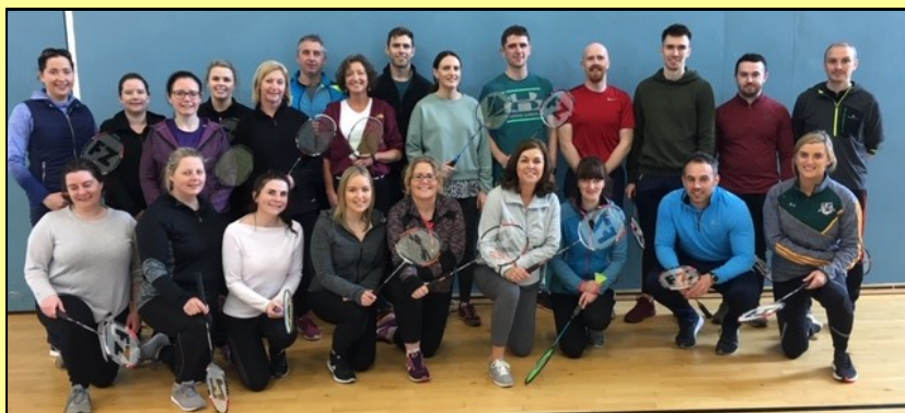
Recent Badminton teacher training!

Thirteen primary schools participated in this joint initiative with each school receiving teacher training, Badminton kitbags with 30 rackets, shuttles and nets along with lesson plans and resources.