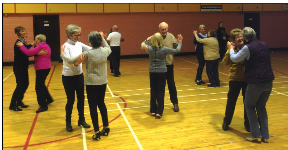
Dance class as part of Older People focus group in Simonstown