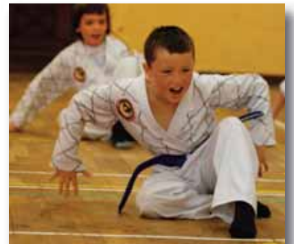
[Genbukan Nimbo Club]