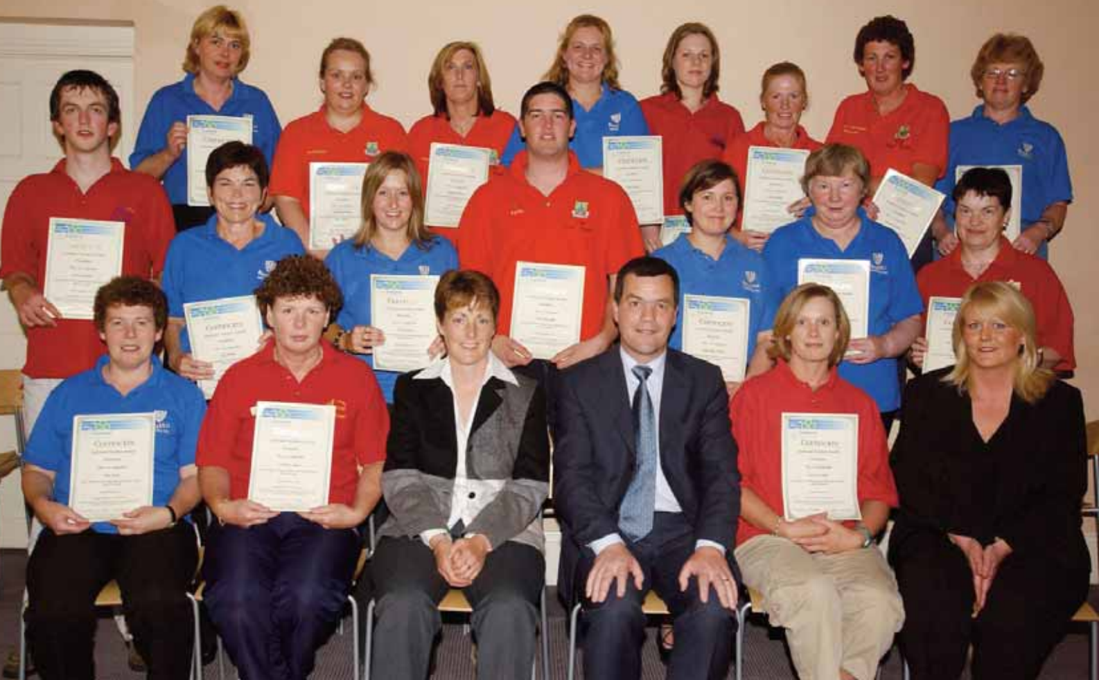
[Presentation: Assistant Teacher Swimming Award - Disability]