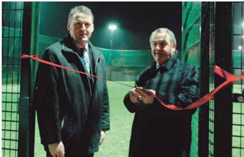
[All-weather pitch opening - Kilmainhamwood]