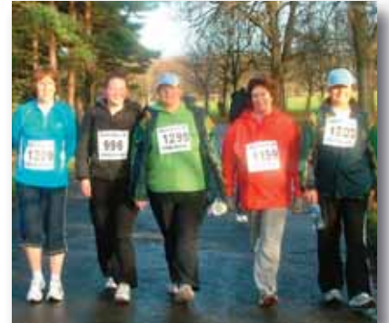
[Participants from Meet & Train Group]