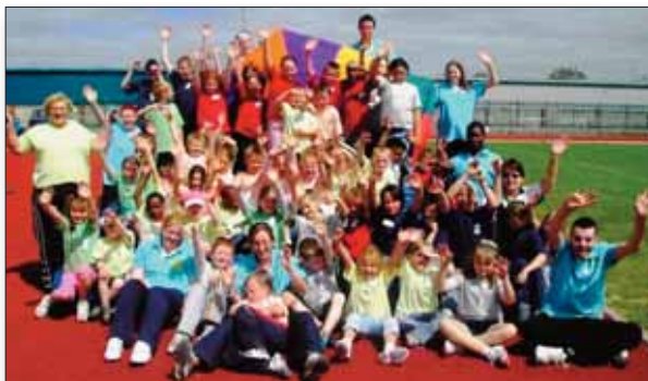
[Sunshine Summer Camp]

Facility Management support : Strategic & integrated approach to facility design and management within Meath in the context of LAPs, phased planning and Community Gain.