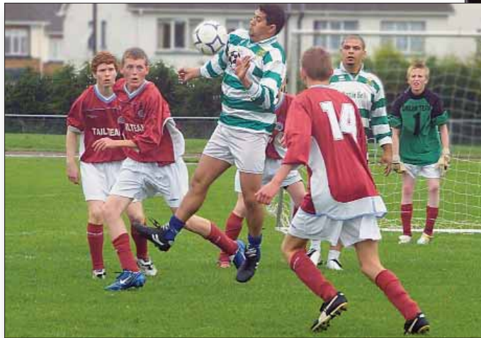
[Mini World Cup]