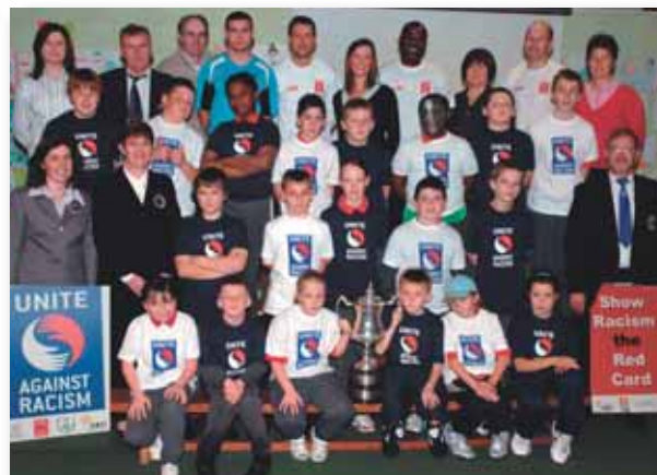
[St. Paul's N.S. Intercultural Festival]