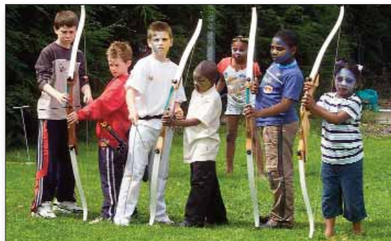
[Young Archers at Meath Intercultural Festival]