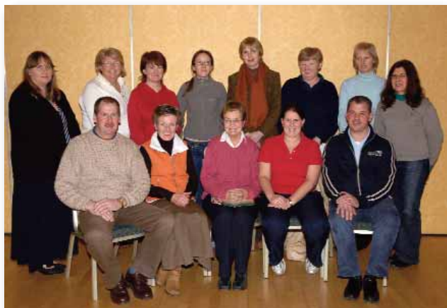
[Club Children's Officers]