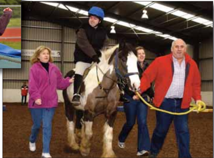
[Kells Riders for Disabled Club]